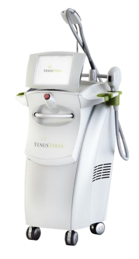
Photorejuvenation, Acne, Hair Removal, Skin Resurfacing and Wrinkle Reduction