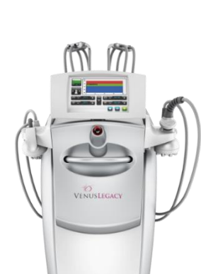
Cellulite & Body Contouring