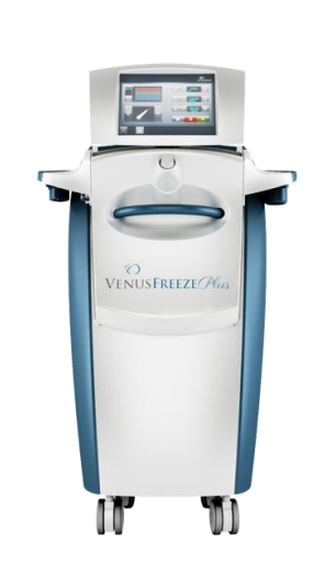
Skin Tightening & Wrinkle Reduction