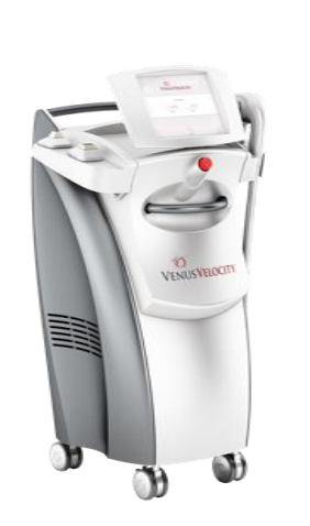
High Speed Hair Removal