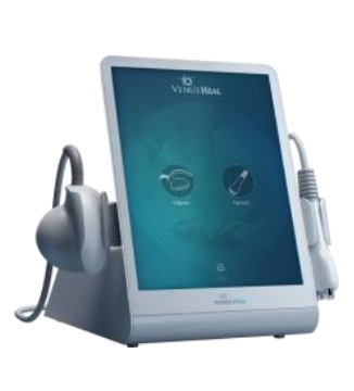
Sports Medicine / Soft Tissue Injuries